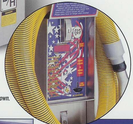
Standard door shown.