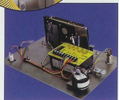
Solid state controls are utilized