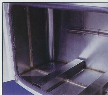
Internal mounting system makes unit more secure from theft or vandalism. All seams fully welded.