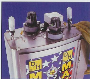
High performance 2-stage motors come as standard equipment.